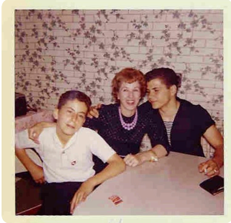
the early years